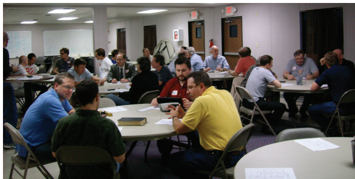
Men at The Crossing meeting at 6:00 a.m. for their HighQuest Forums.